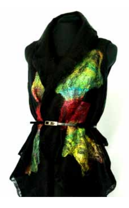
Above: Opalita CENTRE: Oh, Senora and detail at RIGHT