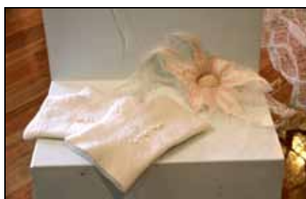
TOP LEFT: Wall hanging , Ros Binst