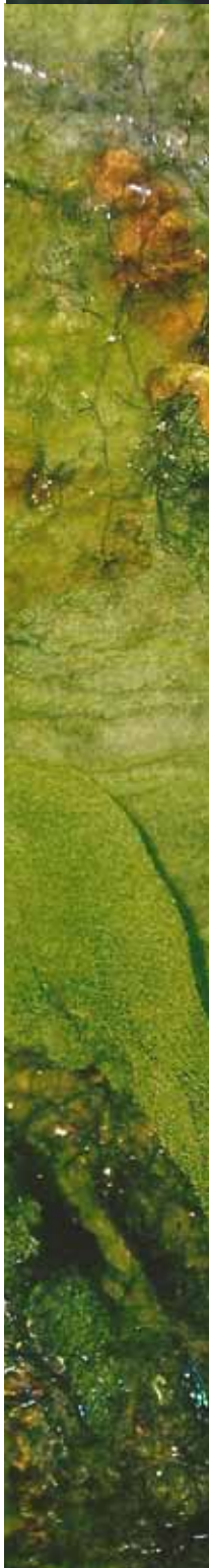
ABOVE Close-up of nuno-felt wrap. Hand-dyed Tissue Silk, Merino, Silks, Mohair and Angelina fibres.