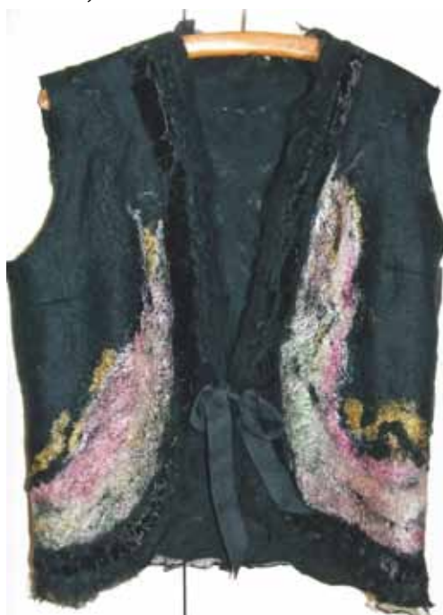
BANNER, TOP PREVIOUS

PAGE: Crepuscule Rose grown from cutting