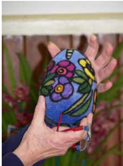
Ros Bint with needle-felted egg made in the Sandie O'Neill workshop