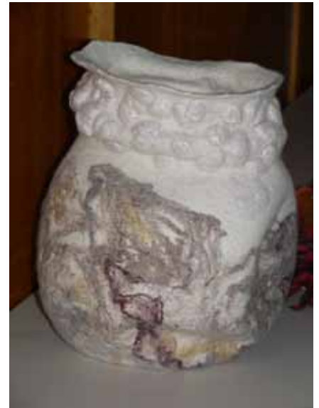
Ros Bint's felted vessel made in the Sculptural Felt workshop (Martien)