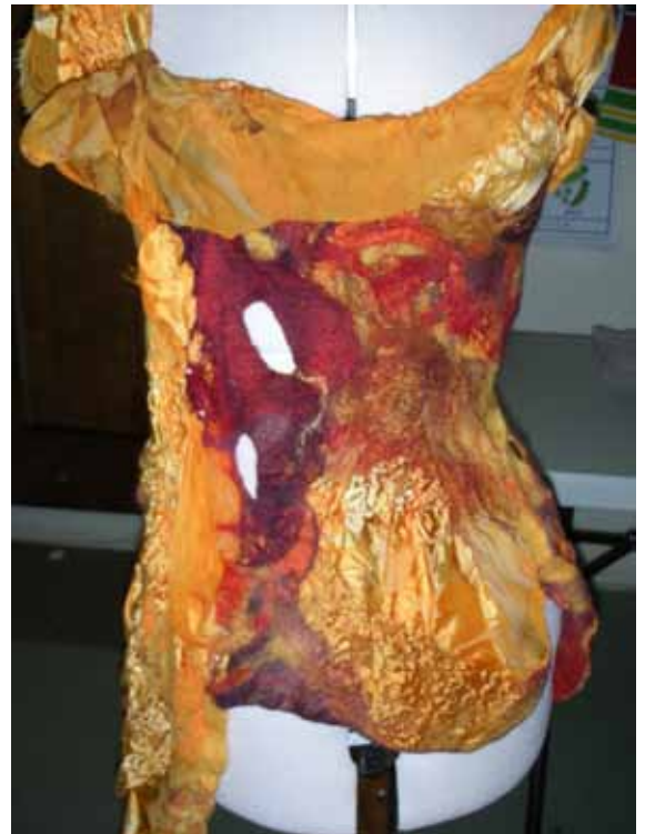
Happy participants, happy workshop! and what wonderful things they have made with the talented Ms Kitty.