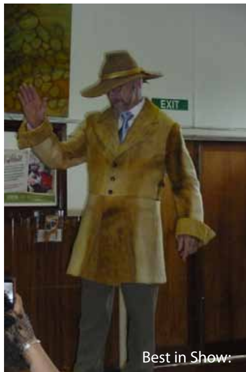
Best in Show: