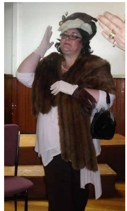
до свидания (do svidaniya)

with apologies to Robyn Steel-Stickland, who was wonderful as the drunken Natarshaa