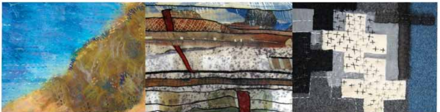
'to the point' three textile interpretations of point nepean national park