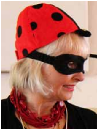
I don't have anything to wear for Easter, so decided to stay being the Christmas Beetle.

I don't have a lot to tell you this issue, except to remind you all that August is getting closer. August is the month of our Annual General Meeting and marks the end of my presidency of the VFI. It would be great to have someone step up now, so that I can help them move into the role of President easily and comfortably, knowing that someone, who has been there, has their back. If we get a new President, it will be my pleasure and honour to remain on the Committee for as long as they wish me to be there.