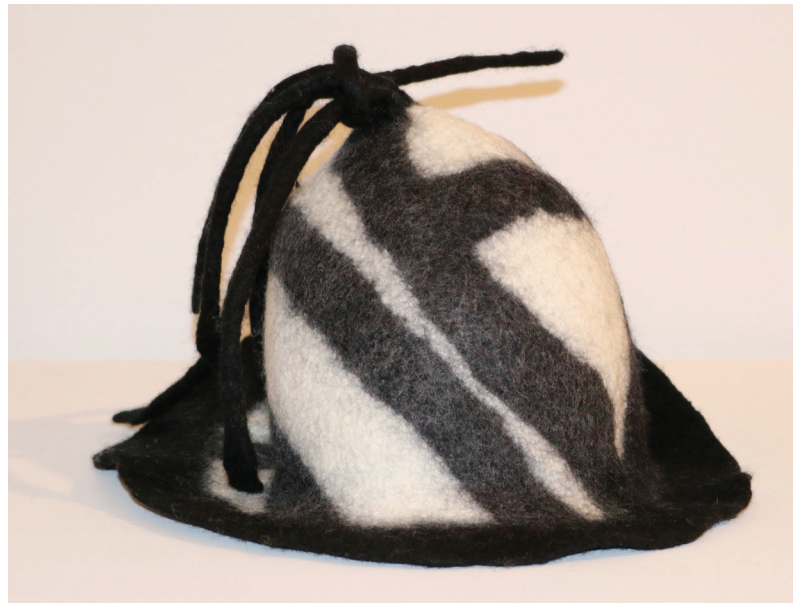
Out of Africa by Sue Hilton

Magazine of the Victorian Feltmakers Inc. Reg. No. A0034651T Issue 93