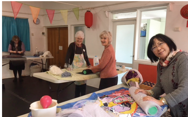
Active members at September Felt Frenzy 2018