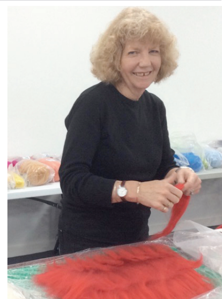
Active members at El Kanah retreat 2018