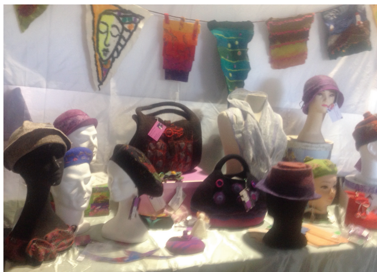
Merchandise for sale