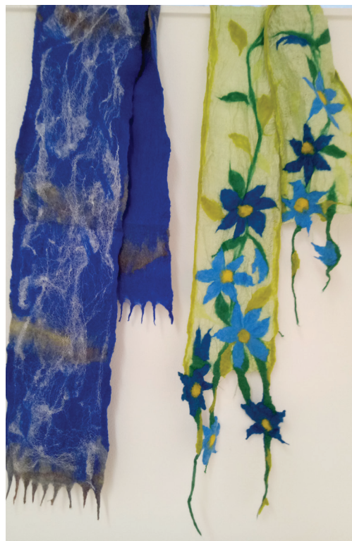
Scarves from Loes Verberg

The meetings are held at: 246 Highfield Road (cnr Milverton Street).